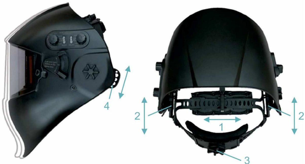
Figure 3. Headband adjustment

Place the helmet over the head and adjust the internal head harness (position 3). Check if the head harness and helmet is suitable for you. If not suitable, please adjust positions 1, 2 and 4 so to make it suitable for you.