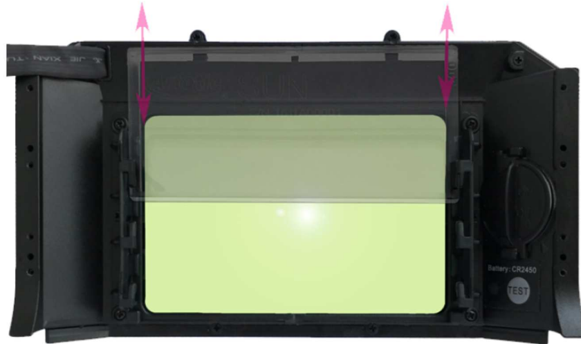
Figure 2. Magnifying lens

The filter can be assembled with magnifying lens conveniently. Purchase magnifying lens if need (order No. S7S7).