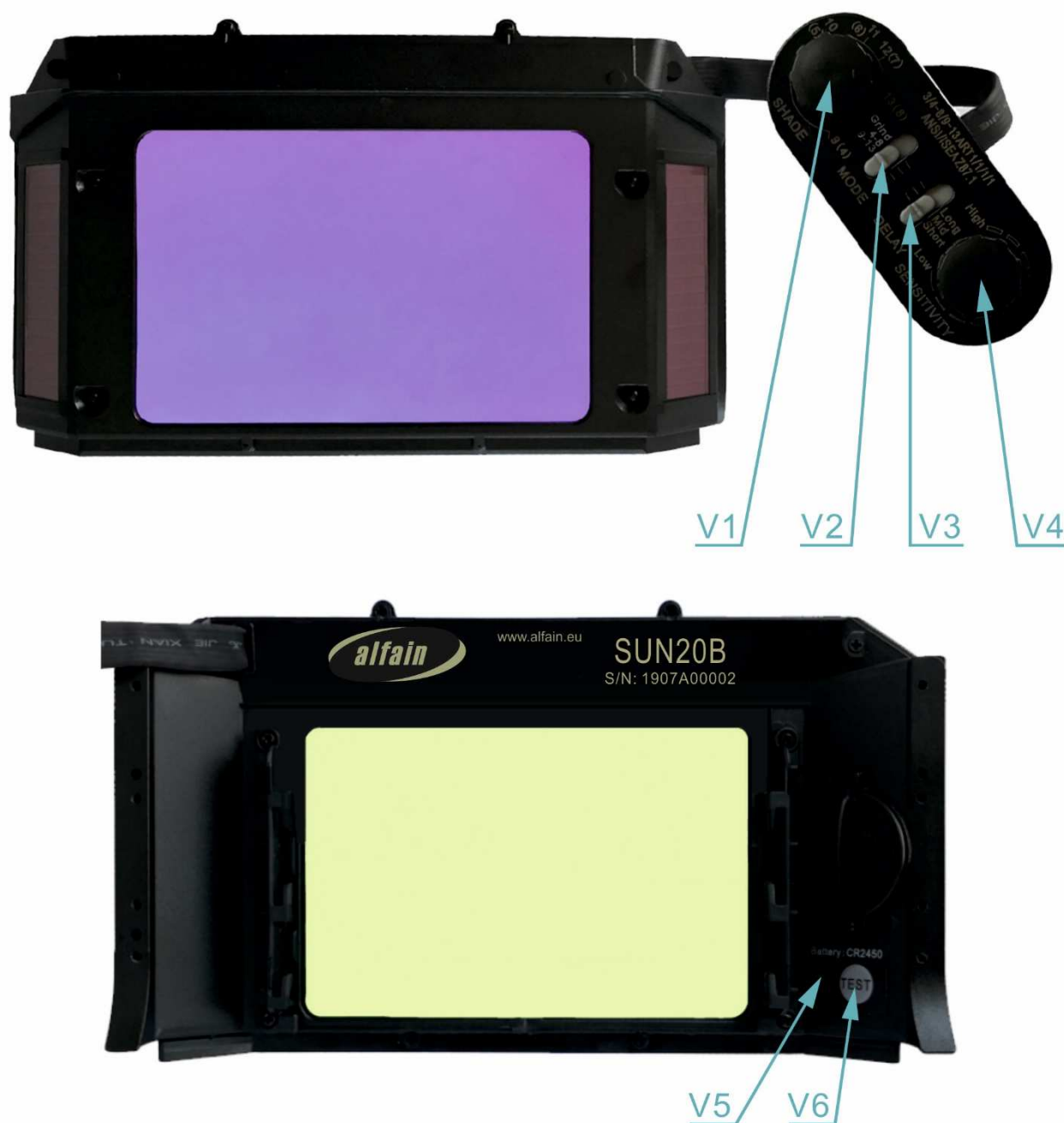
Figure 1. Auto darkening filter