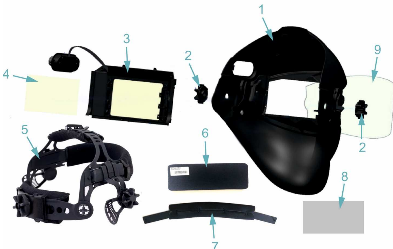
Figure 5. Spare parts of welding helmet